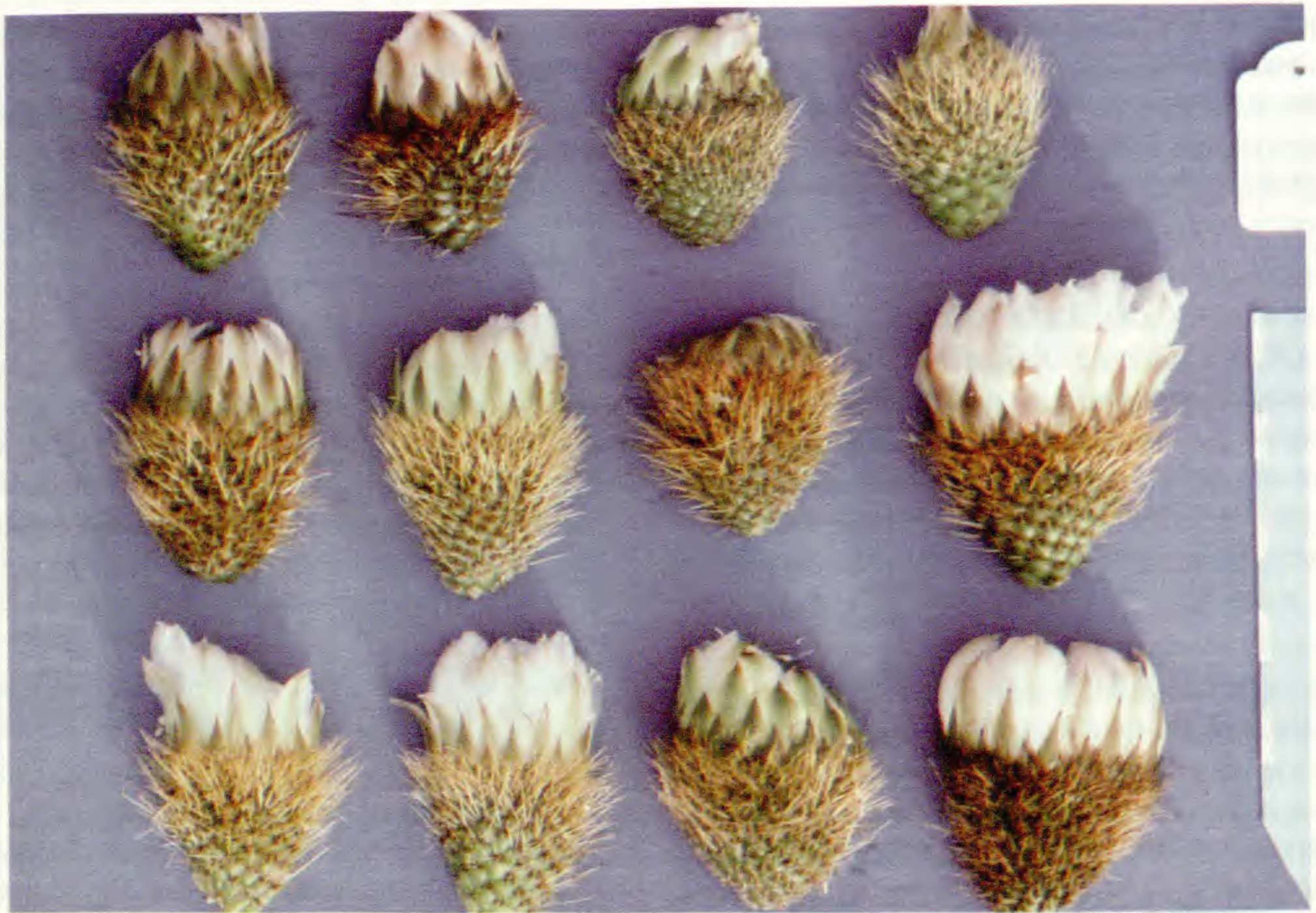
FIG. 1. Advanced buds and flowers of typical Eulychnia castanea (Eggl & Leuenberger 2945, N of mouth of Quebrada San Pedro)